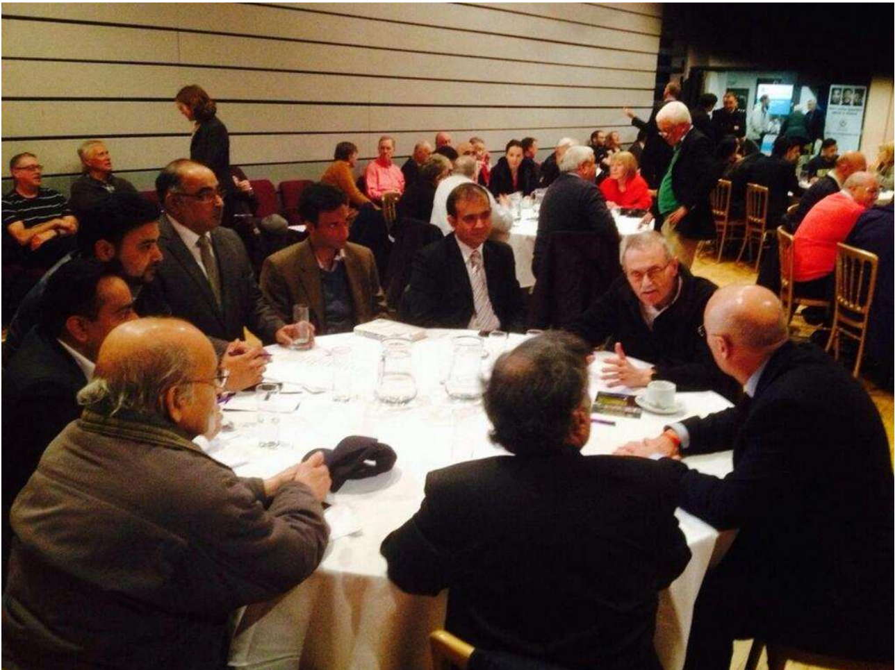
Talking to community leaders about burglary in Surrey Heath

Victims should be at the heart of the criminal justice system. We know that very often they are not. I am determined to make things better for victims of crime in Surrey.