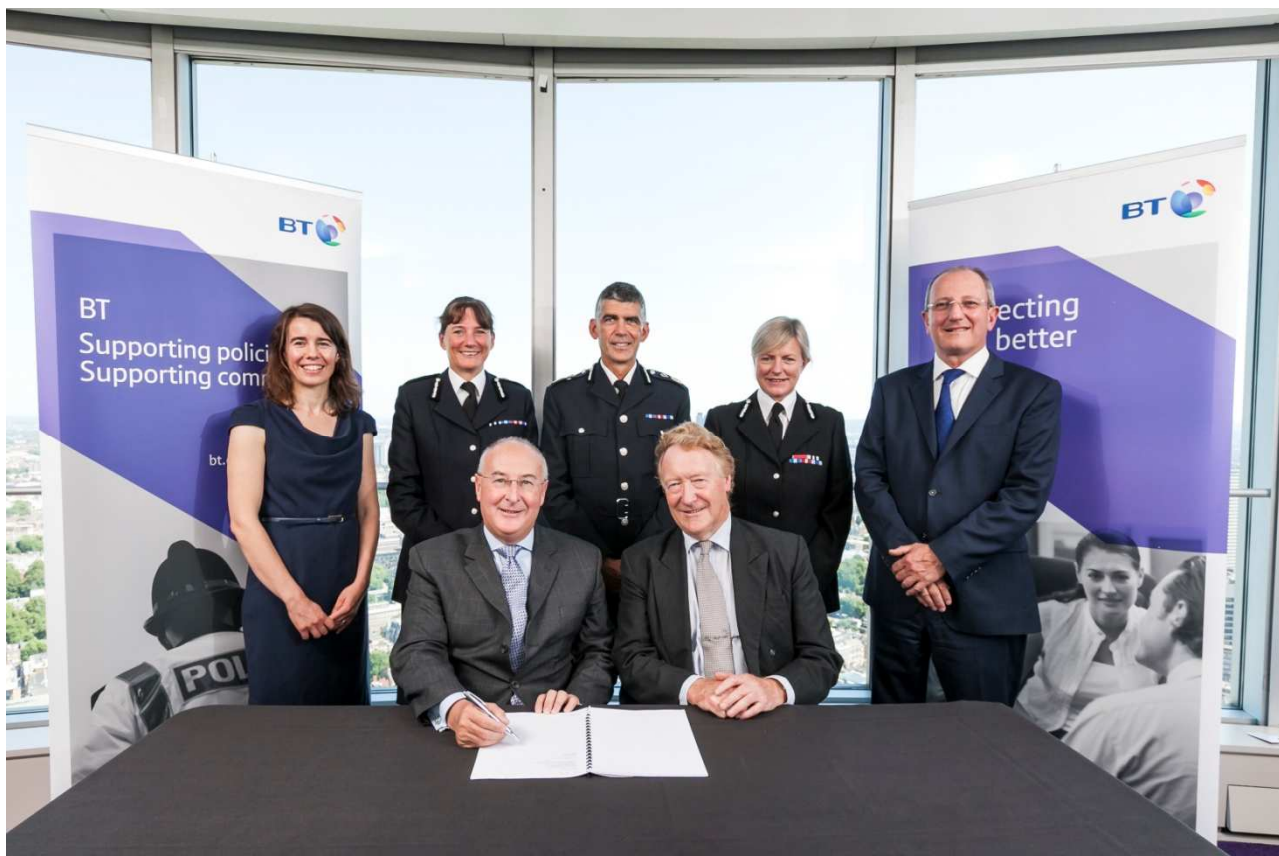
Together with leaders from other South East forces, signing a contract for IT networking technology. Collaborating with other forces helps us modernise and save millions of pounds.