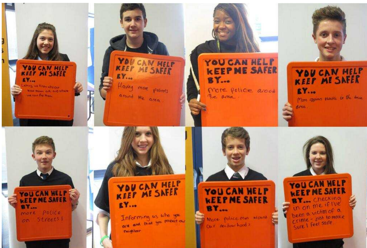
We asked young people what they wanted from the police at a series of events – YouthSHOUT – across Surrey

As a team we have also worked hard to raise awareness of my role and let people know that they can come to me as their elected representative with any concerns or comments they have. Visibility is essential for elected leaders. I have built relationships with the local and national press to bring the issues that concern you to wider prominence – underfunding of police, treatment of victims, inadequate sentencing, whistleblowing and so on. I work with our local councils, Members of Parliament and political leaders in Westminster.