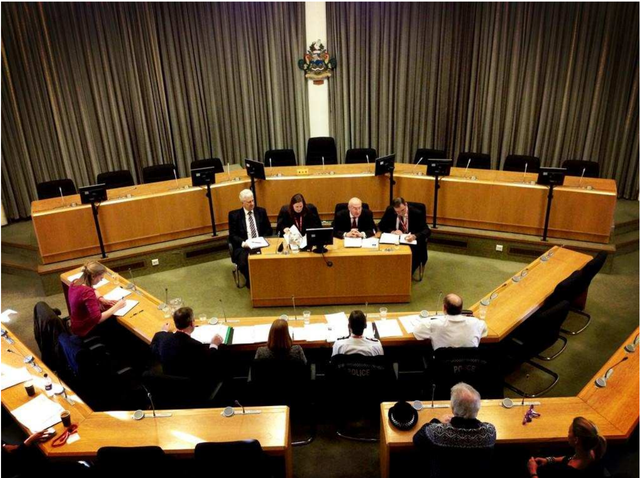
One of my management meetings with the Chief Constable, webcast for the public to see.

I believe that you should be able to see me performing my role of making sure Surrey Police are delivering the things you want to the standard you expect and I was the first Commissioner to make my formal meetings with the Chief Constable open to public view via webcast.